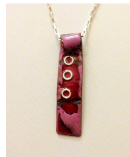
Student piece from December Beginning Enameling class.