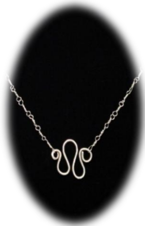
“It Snakes a River” handmade necklace created for the recent Oh, Tulsa! show at Living Arts. Sterling Silver. $175